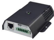
EMD for SNMP Manager Environmental Monitoring Device Monitor Temperature & Humidity Datasheet: Link Item No.: 10120544