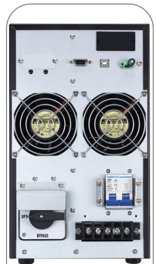
Intelligent Slot, RS-232, USB, EPO, MBS, Terminal