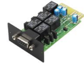
AS/400 Card Datasheet: Link Item No.: 10120515