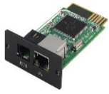
SNMP manager Datasheet: Link Item No.: 10120505