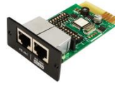
Modbus Card Datasheet: Link Item No.: 10120565